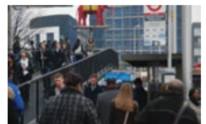
Cyclists take their chances, while pedestrians struggle through at the Elephant