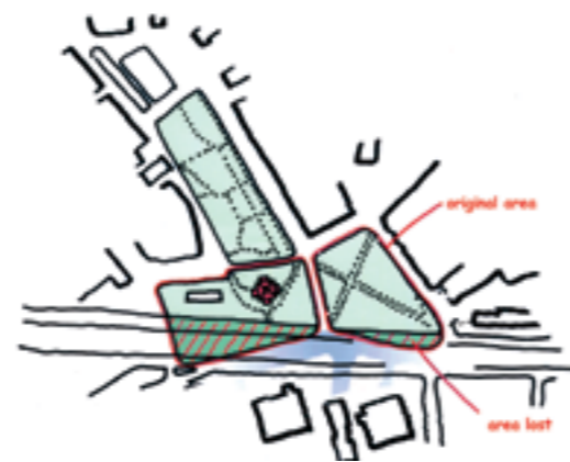
A new pedestrian reality for Edgware Road is being created