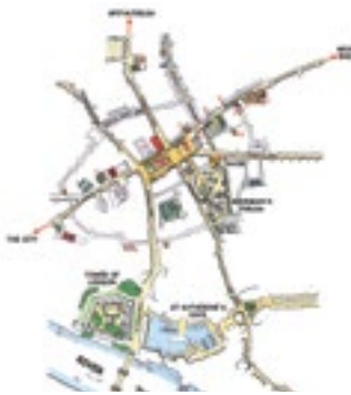
The new Braham Street Park and Aldgate plan