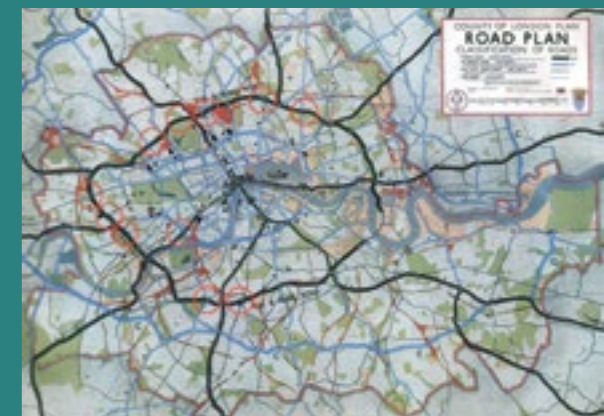
Abercrombie Plan, 1943