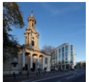
Top: Farrells' proposal for Euston Circus, now being implemented. Left: existing junction. Above: Regent's Place