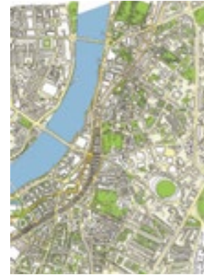
Above: A new Vauxhall town centre. Left: Proposals for Vauxhall, Nine Elms and Battersea