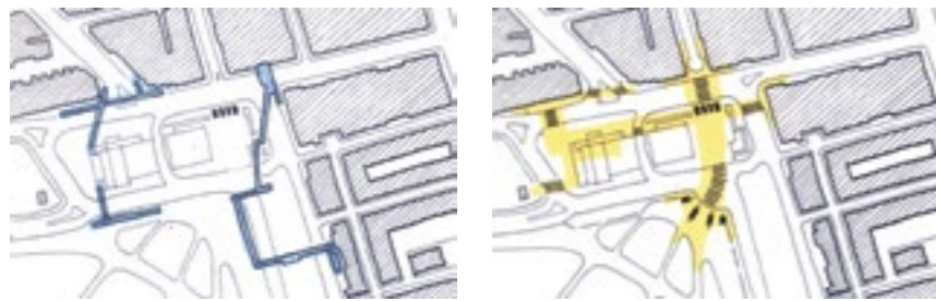
Top: new pedestrian links at Hyde Park Corner. Above left: former underpasses at Marble Arch. Above right: new pedestrian surface routes