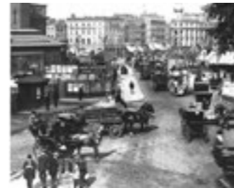
Above: creating a new high street at King's Cross. Left: King's Cross in Victorian times