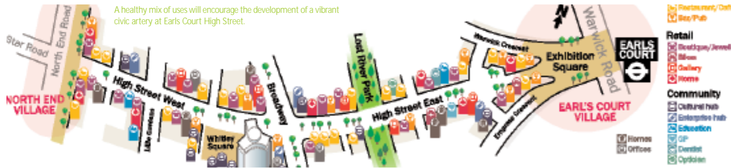
A healthy mix of uses will encourage the development of a vibrant civic artery at Earls Court High Street.

High Streets provide both the framework for our urban arrangement and the centre of life in our city, says Terry Farrell