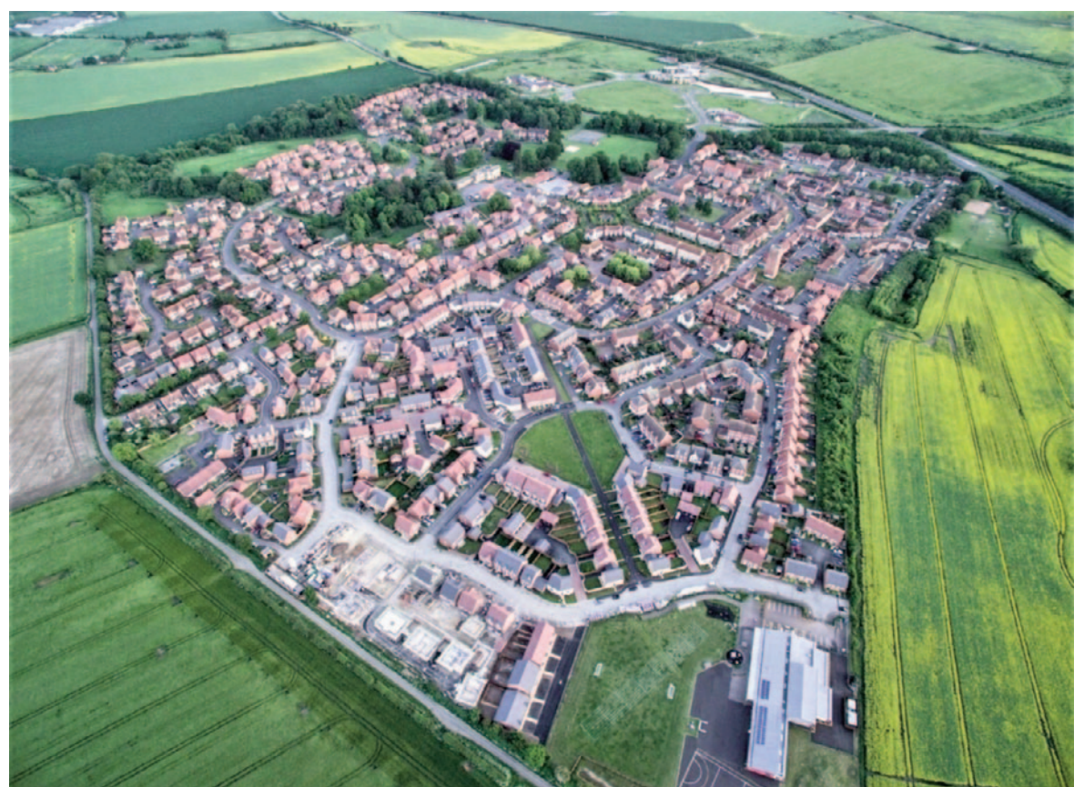
LEFT: Aerial Photograph of Fernwood from the north

As the IL is to be introduced over a number of years, it raises the intriguing question of what will be the approach of the other political parties to this new attempt at land value capture? A political consensus on this would be the best way of ensuring that the development land market remains functioning. Landowners and their advisors would have no choice but to accept that the IL is unlikely to change, and would have to be included in land valuations, when concluding sales agreements with developers. Progress of the Bill though parliament will reveal whether this is wishful thinking, or whether yet again land value capture, which could achieve so many positive benefits for our local communities, is again cursed by our adversarial political system.