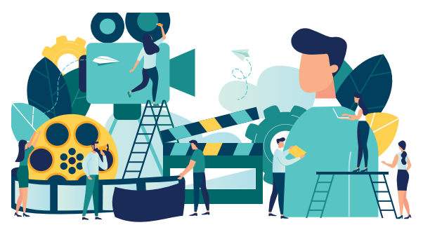
Convening and disbanding like a film's cast and crew

I started the London Collective because the built environment needs this type of business model more than any other