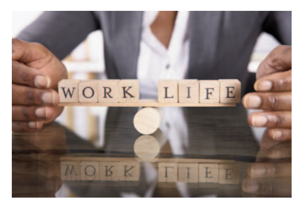
Finding a better work / life balance

Having recognised the limitations of working for a larger practice, and with the economy slowing, I felt the time was right to explore new approaches to work. I was attracted to the idea of becoming self-employed.Needing a greater degree of flexibility with a young child in nursery, partner working more than full time and no support network to speak of. Having my 45th birthday spurred me on to start a new venture, with an attitude of 'it's now or never'.