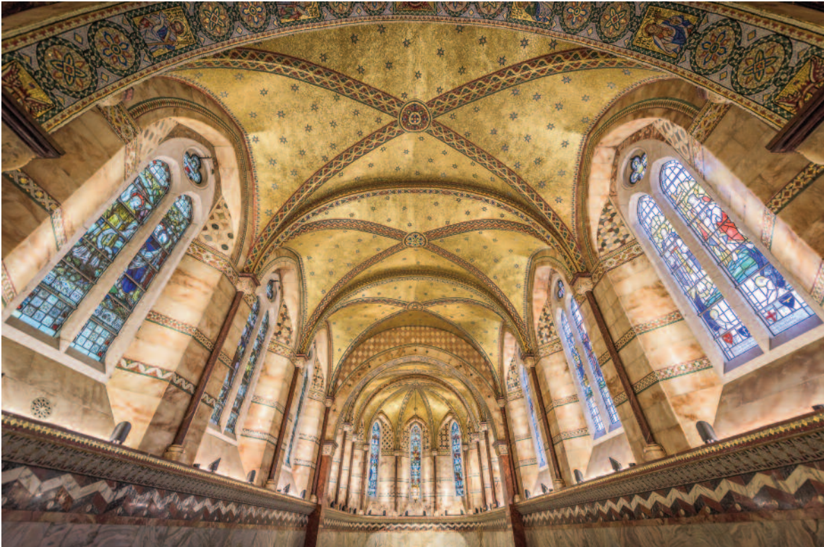
LEFT: Interior of Fitzrovia Chapel