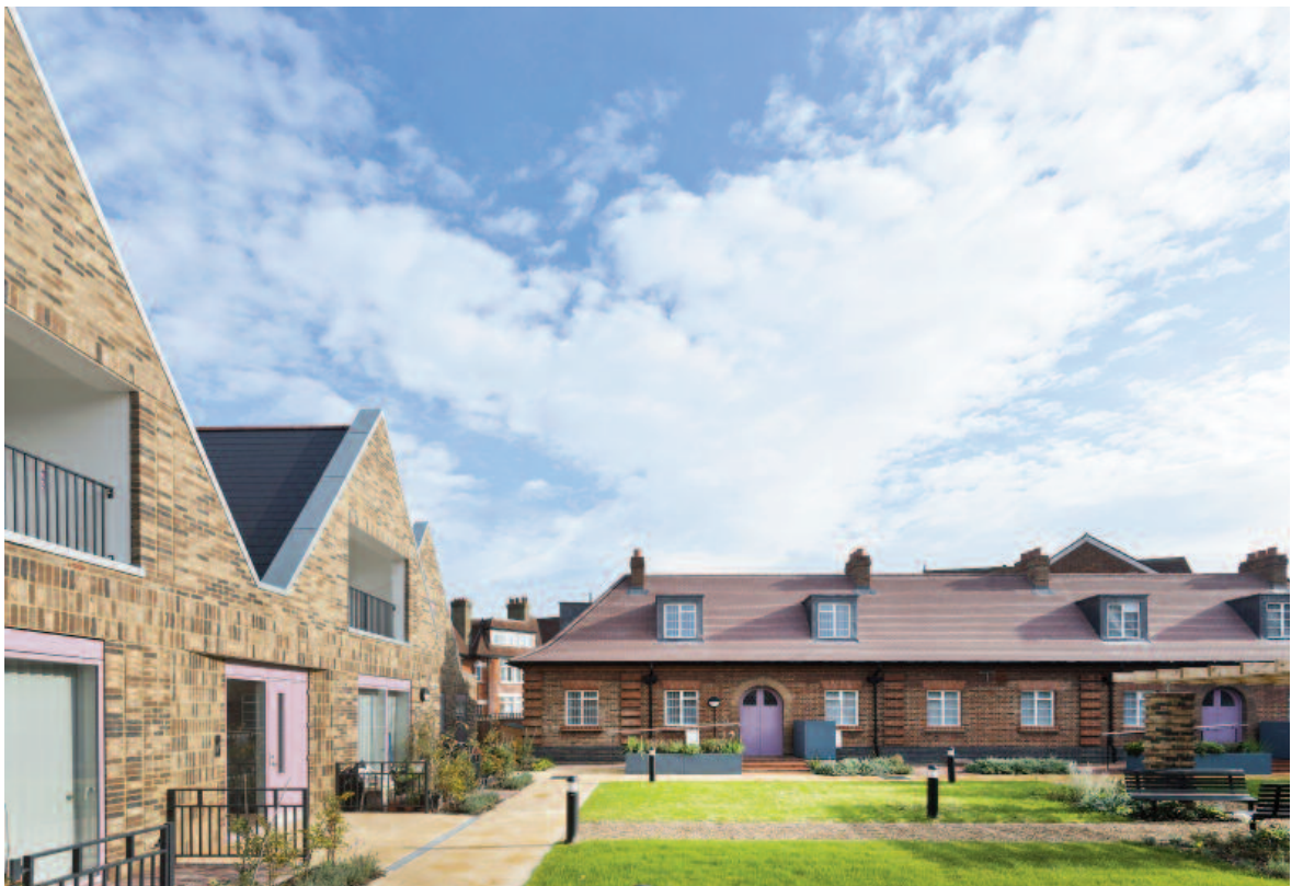
RIGHT BELOW: Thrale Almshouses

out of what we already have. While some types of development may bring risks to heritage, we believe the need to renew and densify parts of the city creates opportunities. These are both to enhance all parts of London's built environment, and also to engage with Londoners to identify the areas,