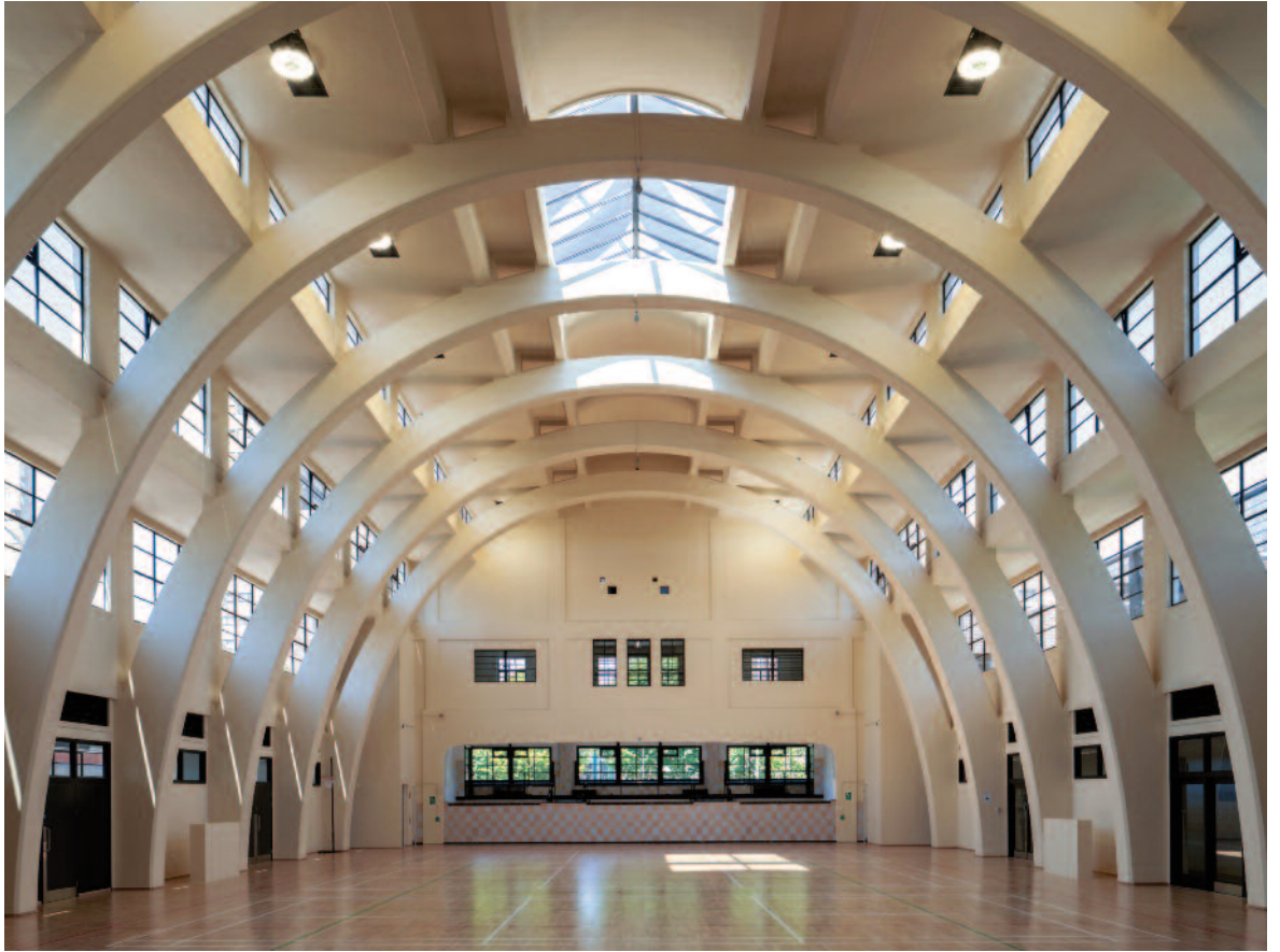
RIGHT: Poplar Baths/Greenwich