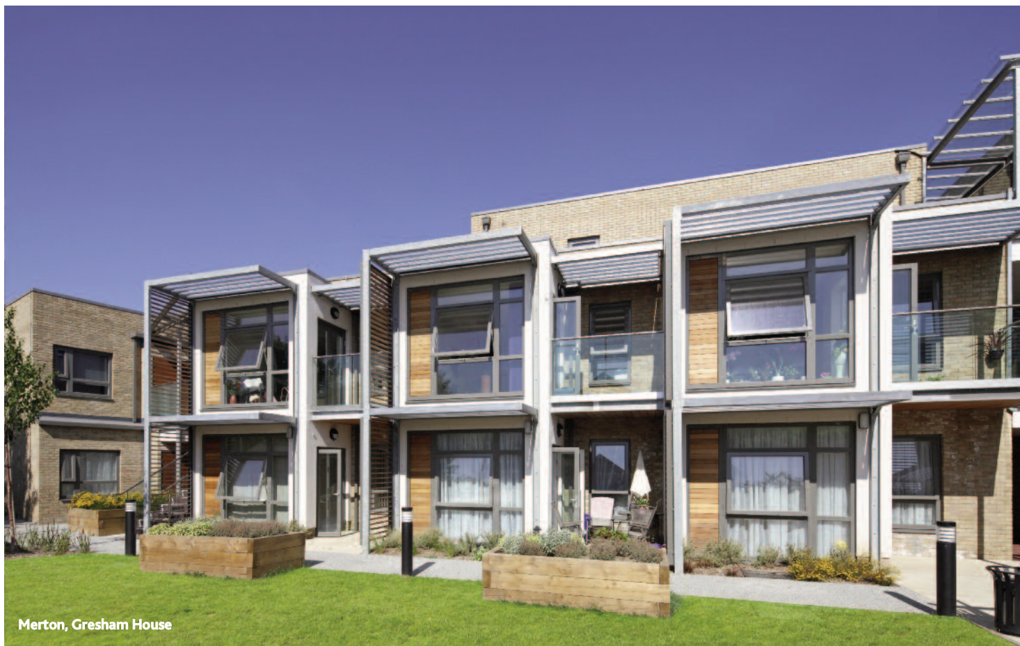
Merton, Gresham House

rience, the newly enacted Care Bill, for instance, is already having a negative impact as planning committee members take fright at having to pick up the tab for the care of relatively wealthy people once they pass the £70,000 self-funding ceiling.