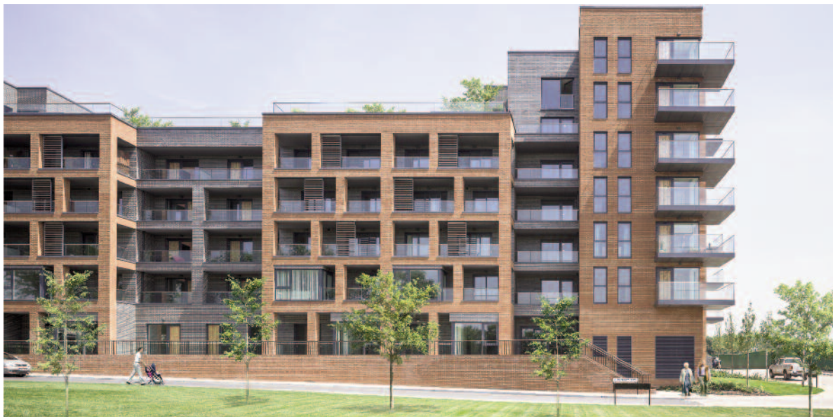
Halton Court, Kidbrooke