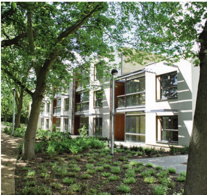
Merton, The Oaks

Of course the elephant in the room is funding. In our expe- >>>