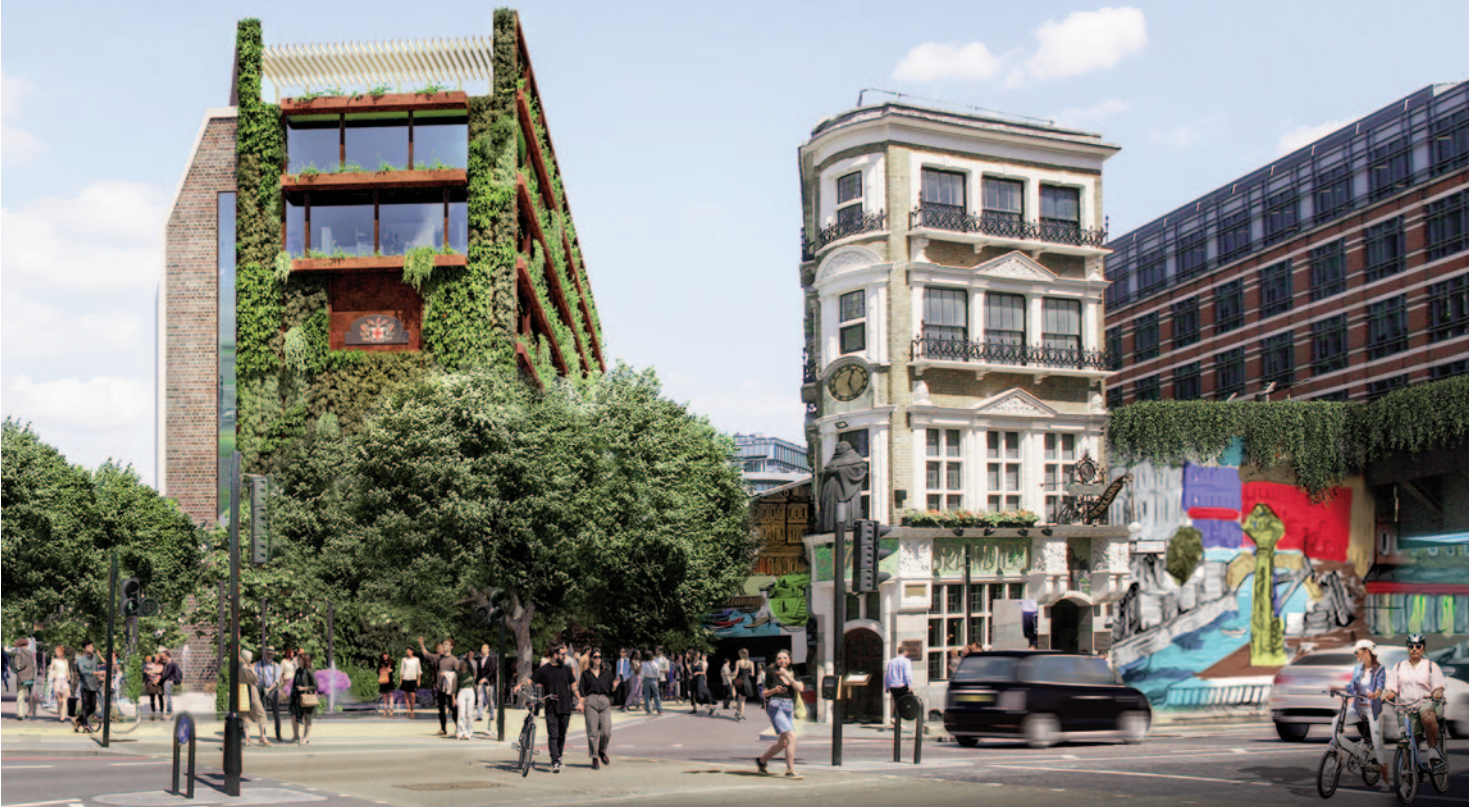
BELOW: Blackfriars AFTER

With an eye to meeting biodiversity targets, our proposals envisage a bold transformation creating, 'Holborn Forest'. Tree planting and art installations would create an urban oasis and a place to unwind in this western side of the City. Holborn Forest would diversify the out-of-office experience, helping create a desirable location for occupiers, residents and visitors.