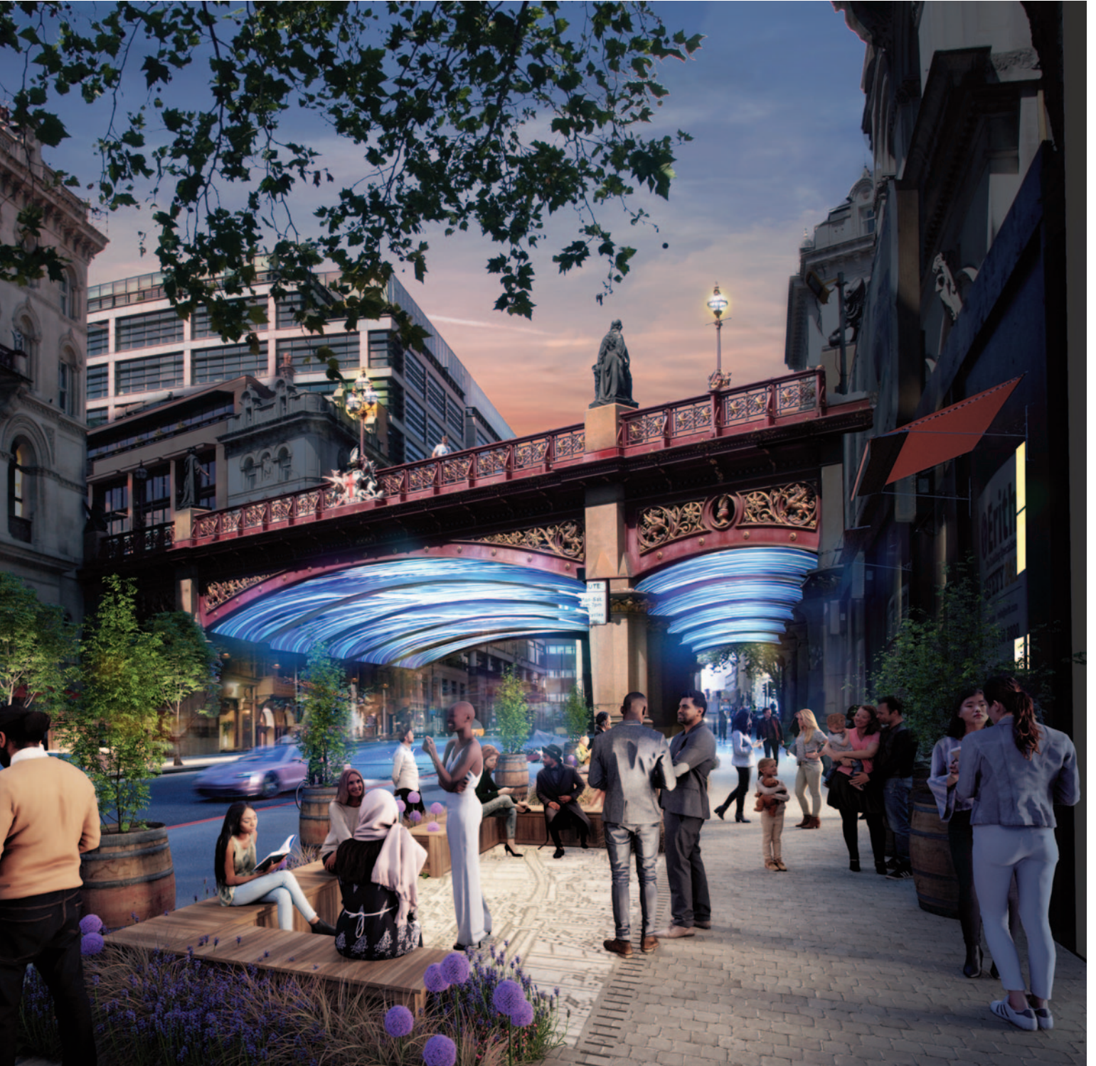
BELOW: Holborn Viaduct AFTER