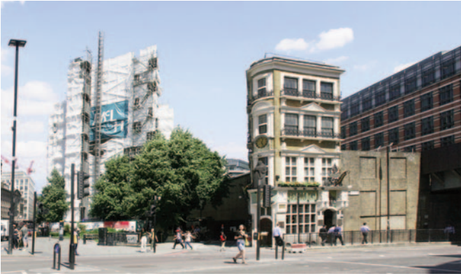
LEFT: Blackfriars BEFORE