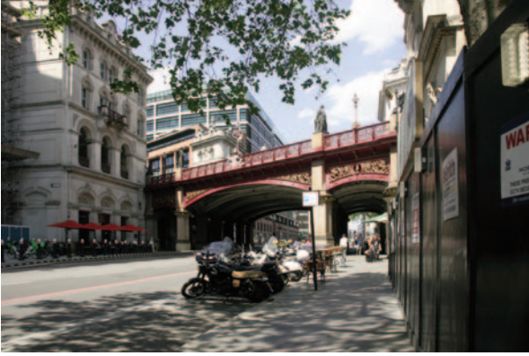
LEFT: Holborn Viaduct BEFORE