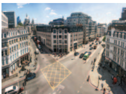
ABOVE: Ludgate Circus BEFORE