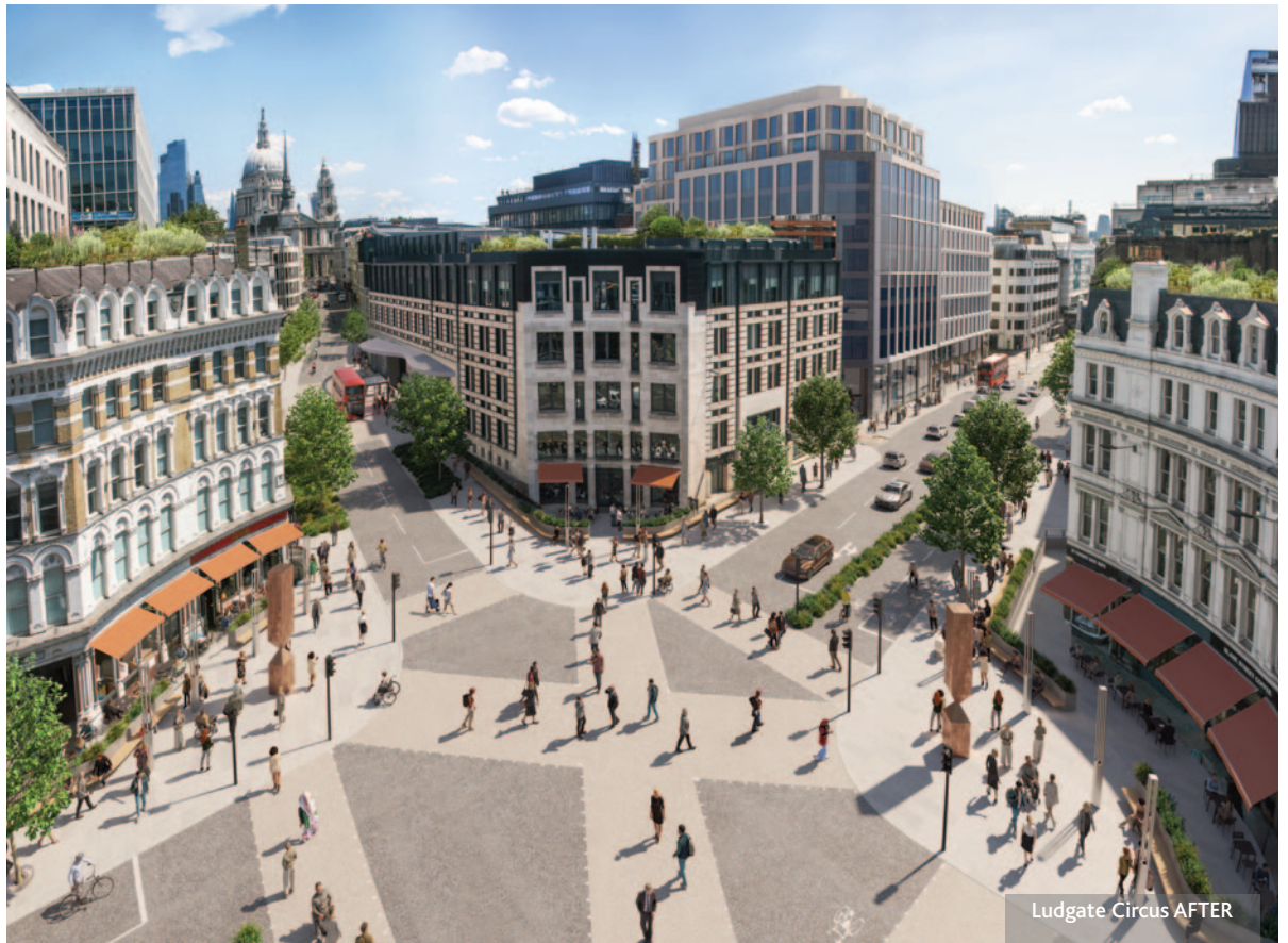
Ludgate Circus AFTER

An unprecedented development pipeline is set to transform the skyline and buildings across the Fleet Street Quarter's 43 hectare footprint. Over the next five years over 3m sq ft of Grade A commercial space will be delivered, which will support the 25,000 additional workers set to come into this area of the City by 2028.